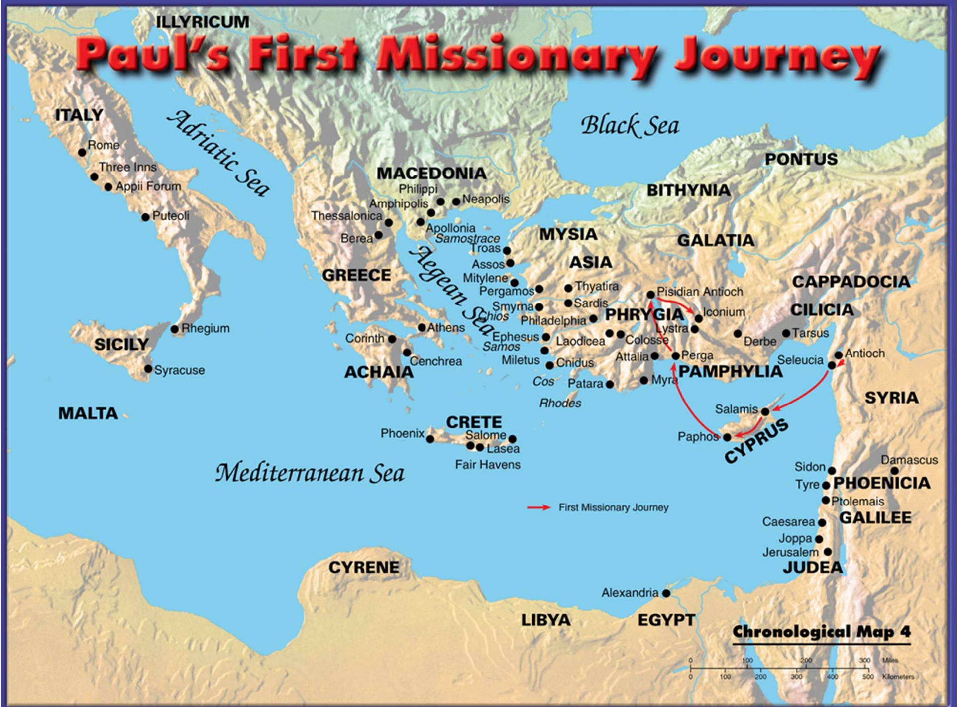
Chronological Map 4