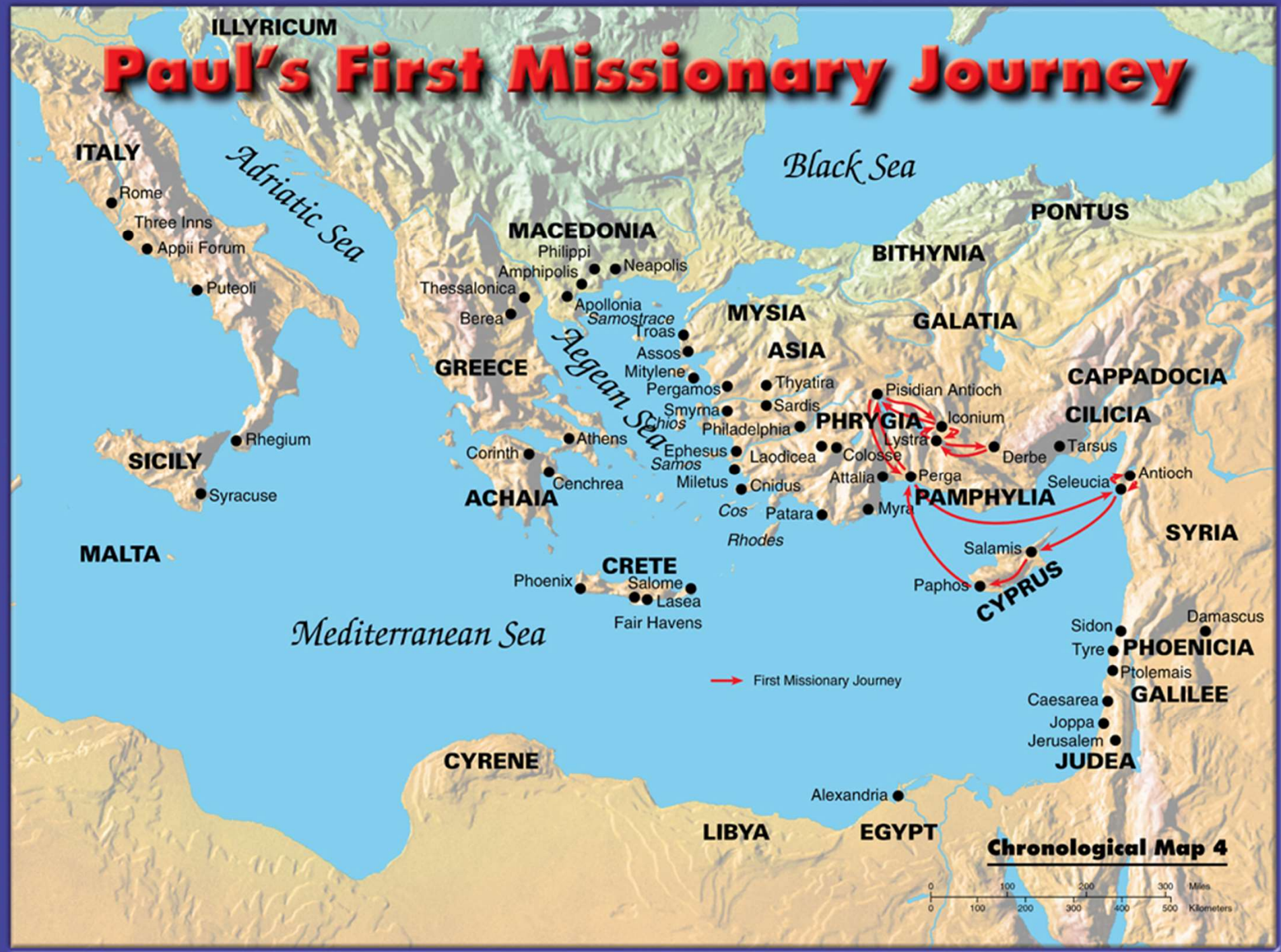
Chronological Map 4