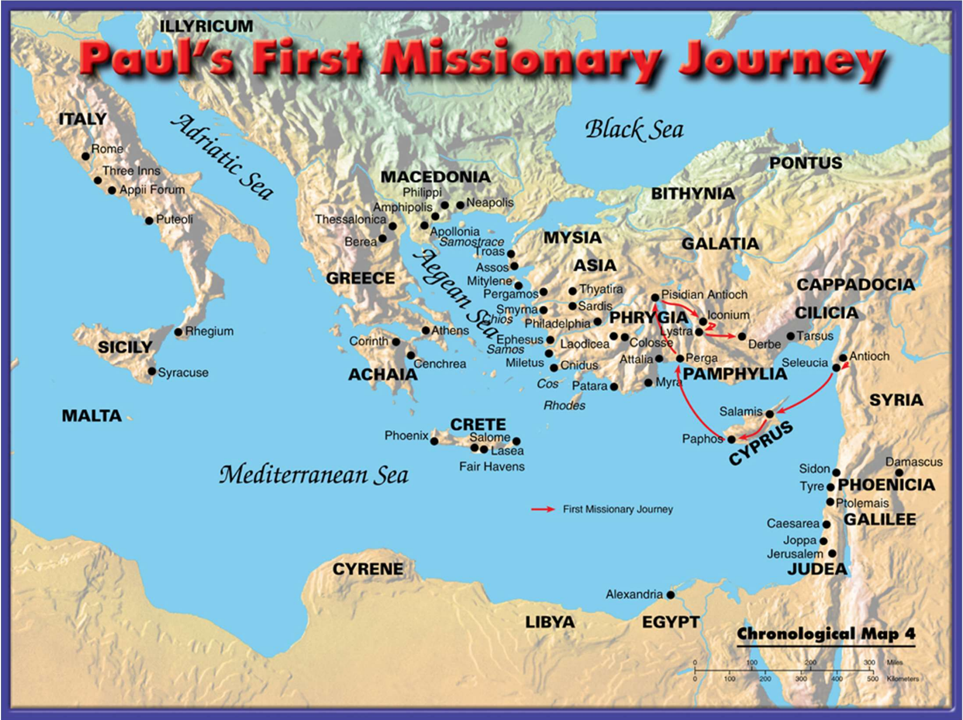
Chronological Map 4