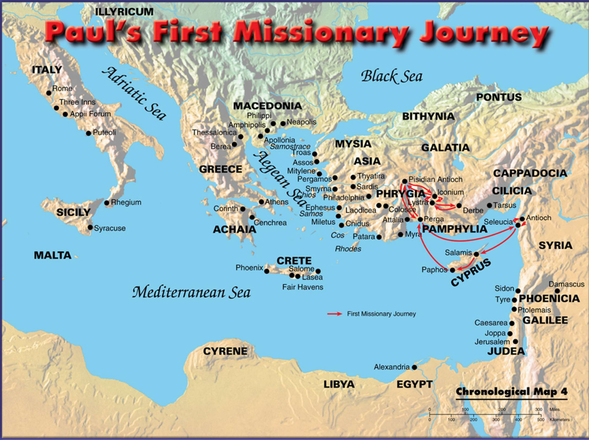
Chronological Map 4